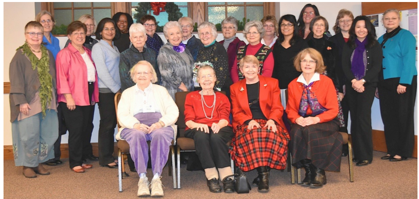
AAUW Manhattan Branch members and guests at December 2015 meeting.